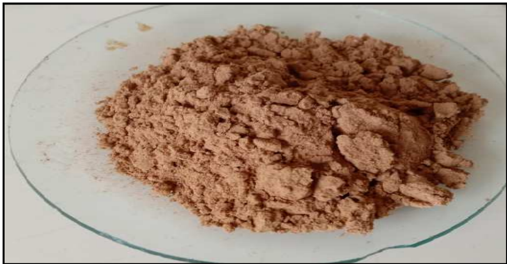
Figure No.1: Formulated Herbal Dentifrice